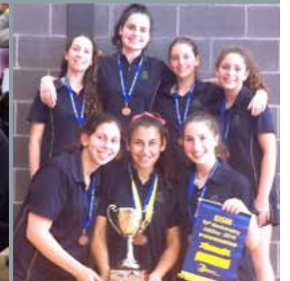
Senior Girls Volleyball Team - Grand Final Winners