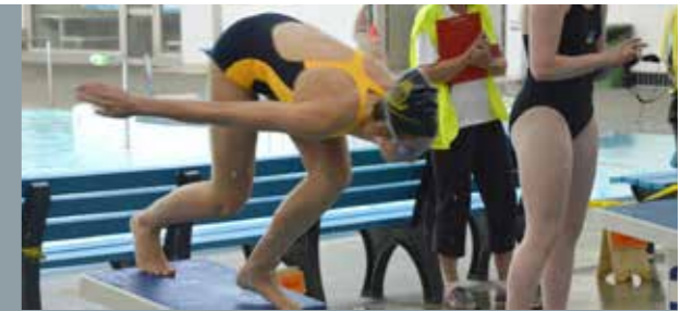
EISM Swimming in Term 1 - TKDS best ever result finishing in 2nd overall in both boys and girls competitions.