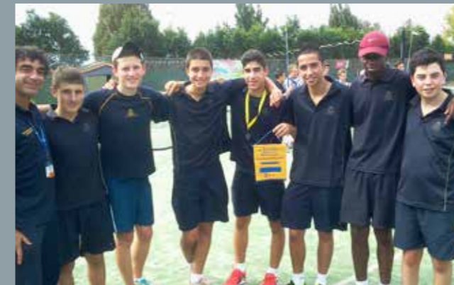
Senior Boys Tennis came runners up in the EISM Summer Season

In 2018, I would like to be competing in the Commonwealth Games in Brisbane. I think there is a small chance of this although I'll only be 19 and there are some very good riders who will also be trying to make that team. After that I would like to aim for the Tokyo Olympics to ride the Teams Pursuit. My short term goal is to get a VIS Scholarship. Being in the State Institute pathway will allow me to pursue a track endurance pathway. Failing that I will look to opportunities to race as a professional on the road. I want to do well in Years 11 and 12 and then maybe take a gap year to travel to Europe to race and see how I go. Although I also want to keep studying in case the career on the bike doesn't work out.